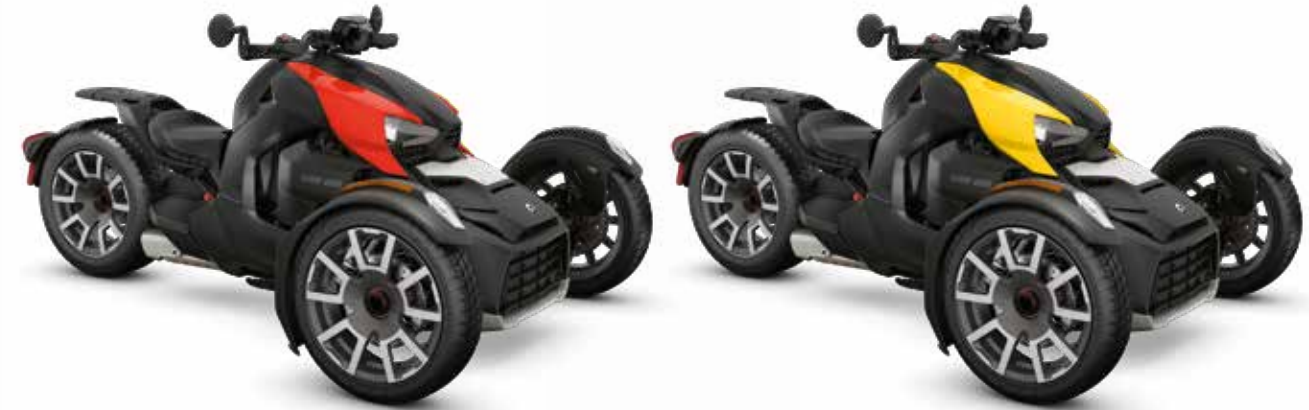
Units shown with Classic Series panel kits. Visit canamryker.com/shop for the most recent panel kit options and availability.